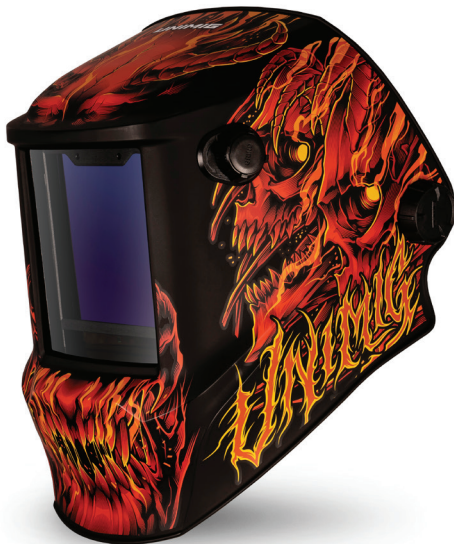
Professional Series Welding Helmet - Demon