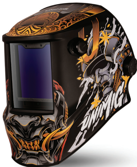
Professional Series Welding Helmet - Samurai