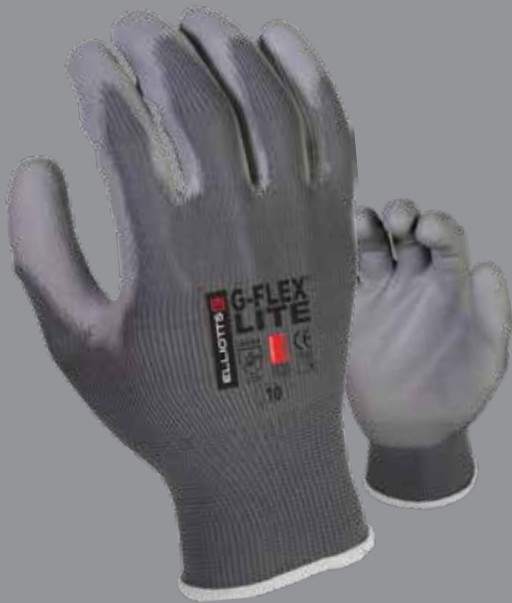
ELG3100 G-FLEX LITE G-Flex Series Glove