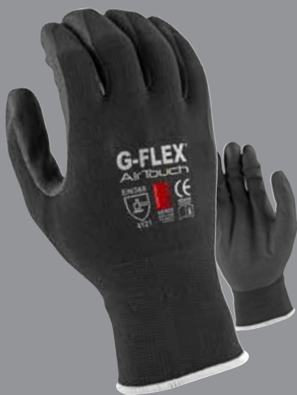
ELG3310 G-FLEX AIRTOUCH GP G-Flex Series Glove