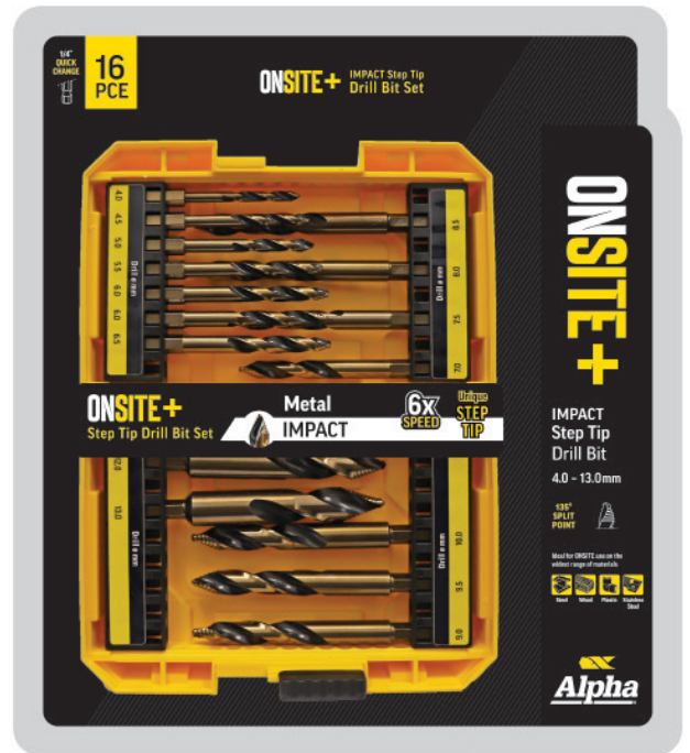
16 PCE SET Sizes 4.0 - 13.0mm