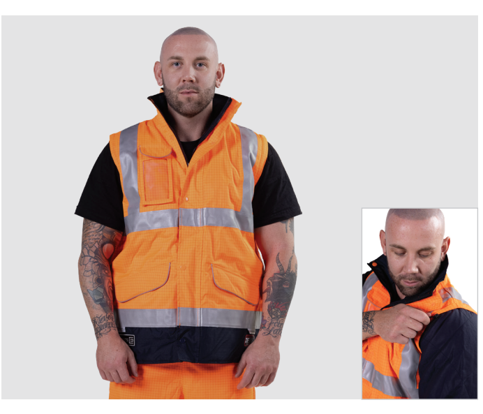
Turn it into a Vest Remove the outer lining and the sleeves