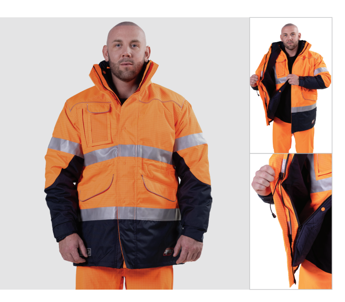
Wet Weather Jacket Remove the inner lining