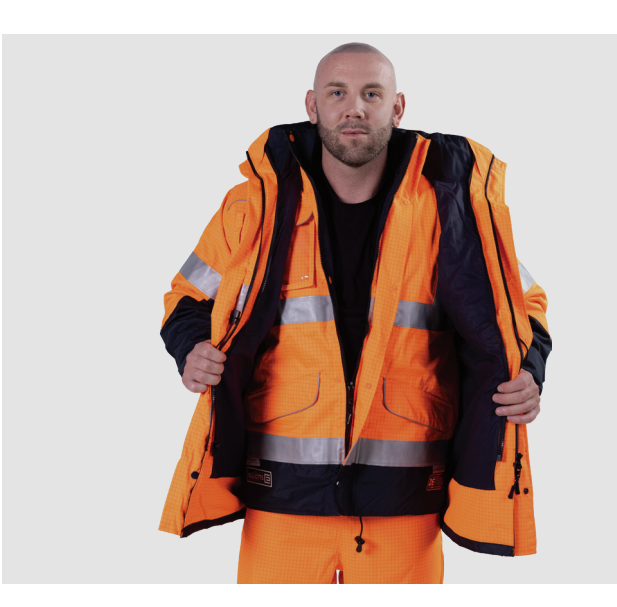
Winter/Wet Weather Jacket Wear the entire jacket