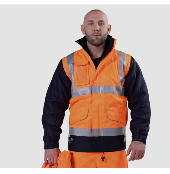
Winter Jacket only Wear the inner lining only