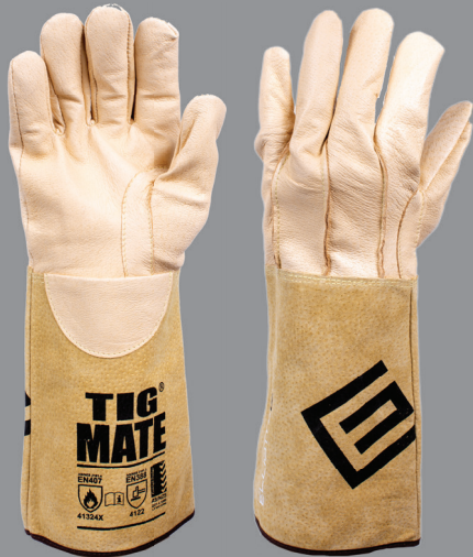
TIG16 TIGMATE® LONG CUFF Welding Gloves