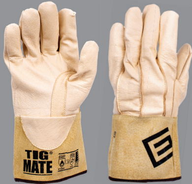
TIG11 TIGMATE SHORT CUFF Welding Gloves

SAME QUALITY. SAME PERFORMANCE. NEW LOOK!