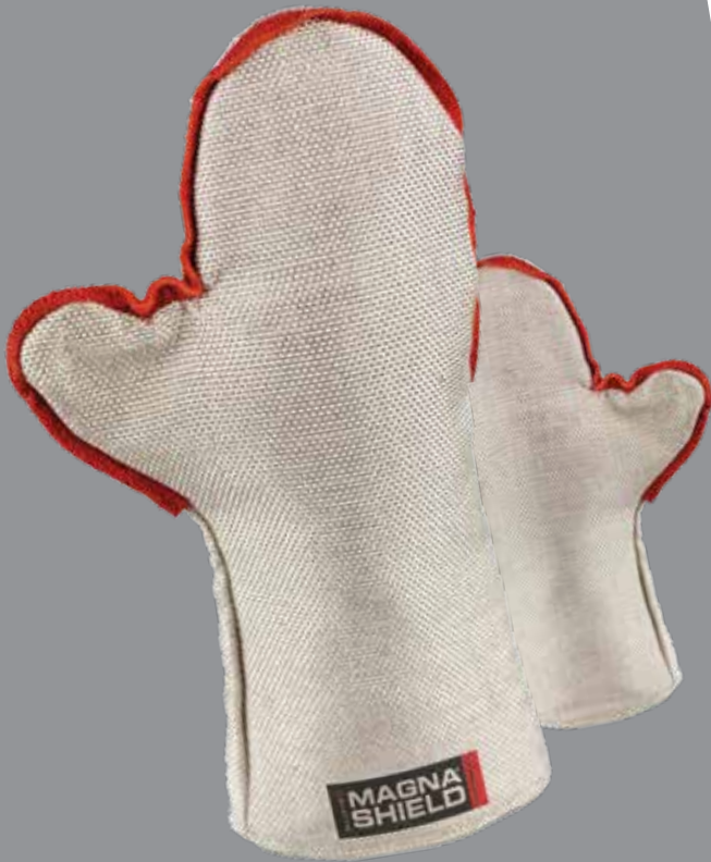
HSM16WL HEATSHIELD MITT Heat Resistant Mitt