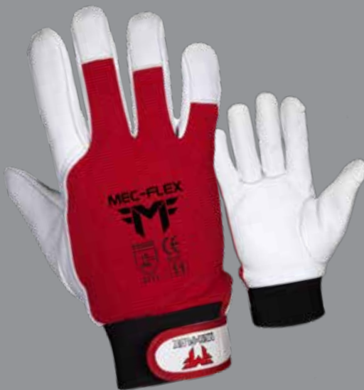
GSG MEC-FLEX RIGGER GSG Mec-Flex Series Glove