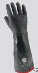
ELG7520 CHEMVEX NX20