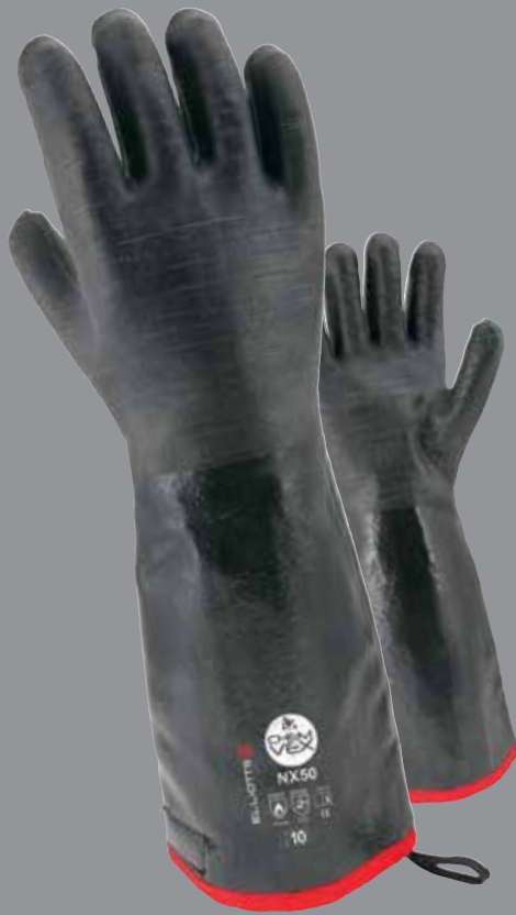
ELG7550 CHEMVEX NX50 Heat Resistant Glove