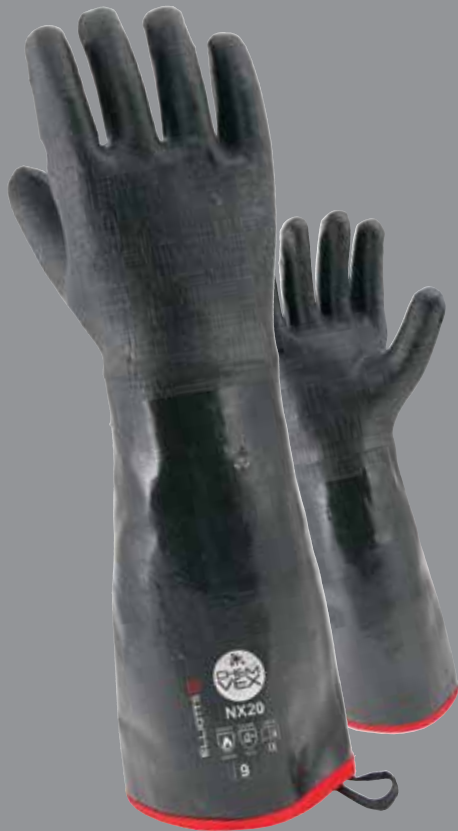
ELG7520 CHEMVEX NX20 Heat Resistant Glove