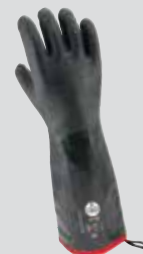
ELG7550 CHEMVEX NX50